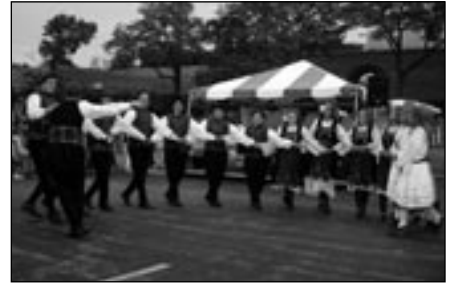
Orpheus performed at the Sts. Peter and Paul Church Greek Festival in July.