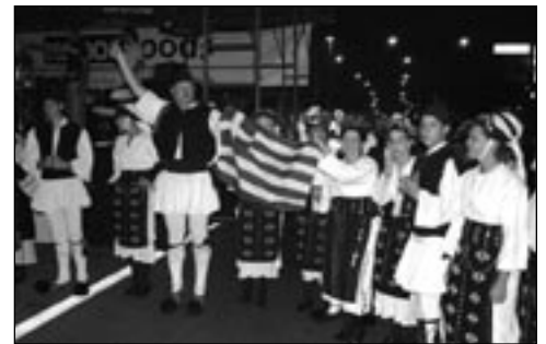
Members get pumped up before the start of the performance during the annual Greek Town festival in Chicago at the end of August.