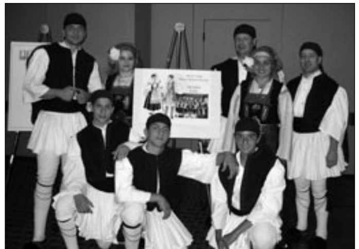
Orpheus members had a chance to showcase a suite of Greek folk dances during the 2006 North America Bridge Championships, which took place at the Chicago Hyatt Hotel.