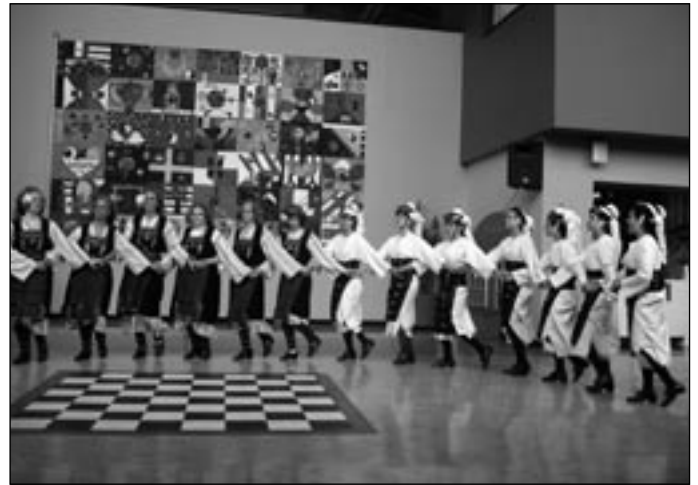
The Chicago Children's Museum, along with the Hellenic Museum, presented an exhibit: Passport to the World: Greece. The exhibit celebrated Greek music, dance and crafts. Orpheus also performed.