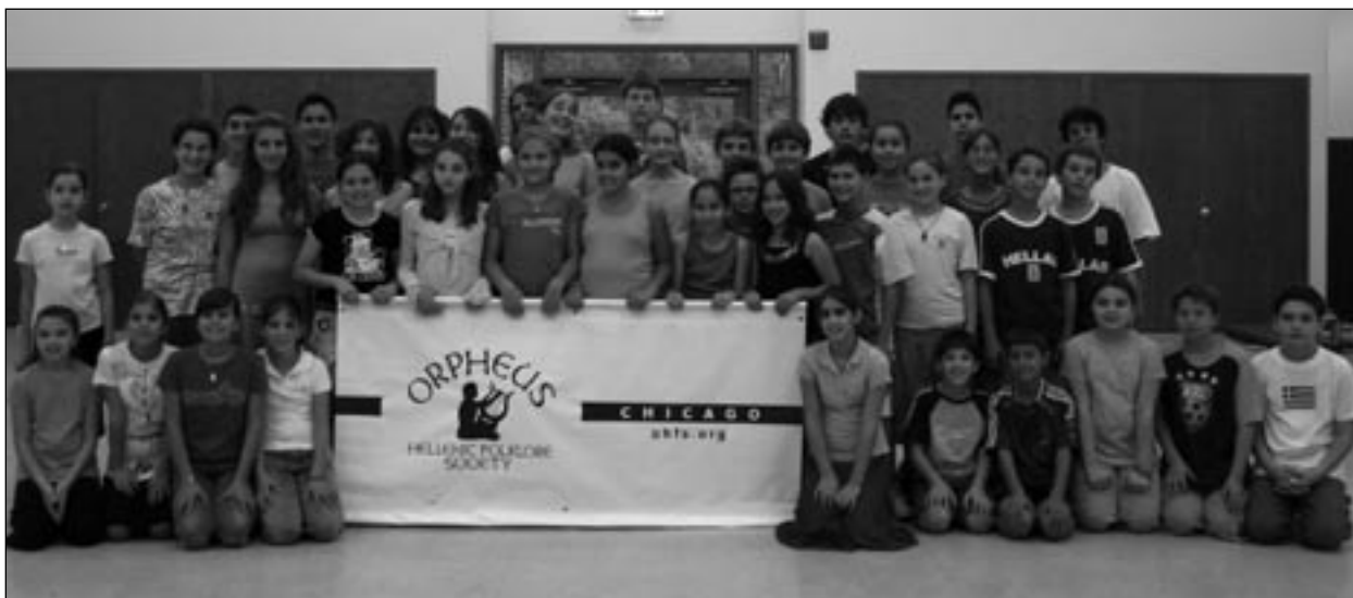
The 2006-2007 Orpheus Youth year started the first week of September. Members of the Northbrook branch pose for a picture.

The summer went by quickly and more than 90 members started off the new youth year with a lot of enthusiasm and energy. Children, parents and instructors are collaborating very closely so that this program continues to succeed. Come and watch the Orpheus Youth Group as they perform at the Museum of Science and Industry on Saturday, December 9, at 2:45 p.m., as part of the "Christmas Around the World" festival. ☐