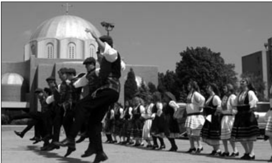
The Orpheus Dance Troupe performed for the family picnic celebration at St. John the Baptist Greek Orthodox Church in Des Plaines, Ill. The St. John community and Orpheus have developed many strong relationships over the years, as many members are also part of the St. John parish.